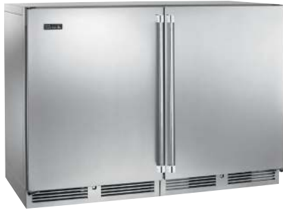
All Solid Door Model