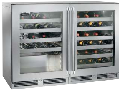
All Glass Door Model