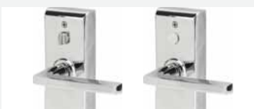
Passage Function Shown in Passage Mode

Adaptors available for brass leversets to fit doors between 1 3/8" and 1 5/8" thick.