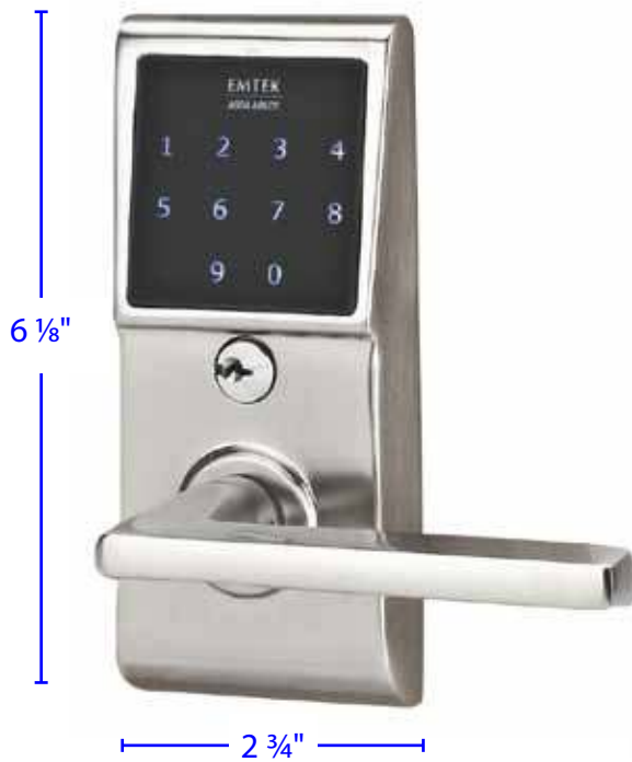
Exterior Projection: 3"