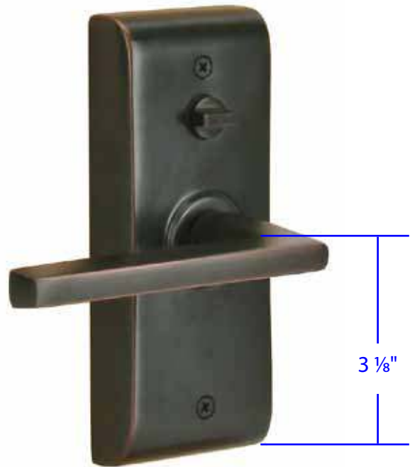
Interior Projection: 3"