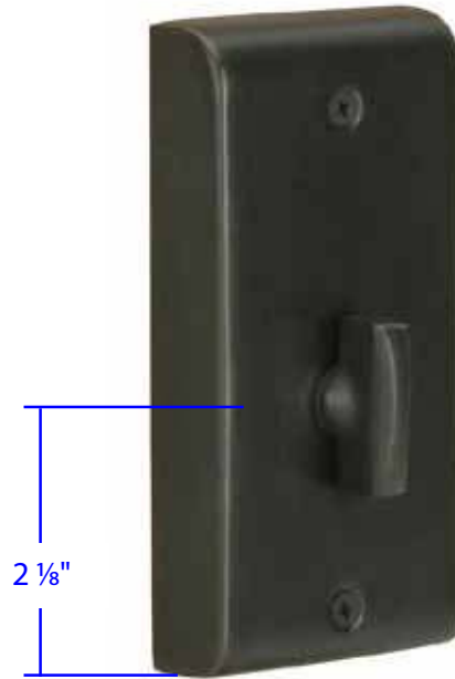
Interior Projection: 1 3/4"