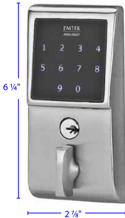
Exterior Projection: 1 1/2"